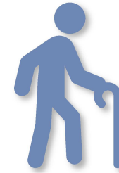
Long Term Disability