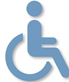
Short Term Disability