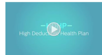
High Deductible Health Plan