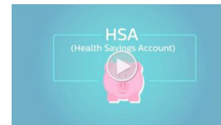
Health Savings Account