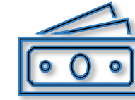
Flexible Spending Account - FSA