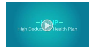
High Deductible Health Plan