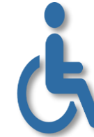
Short Term Disability