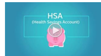
Health Savings Account